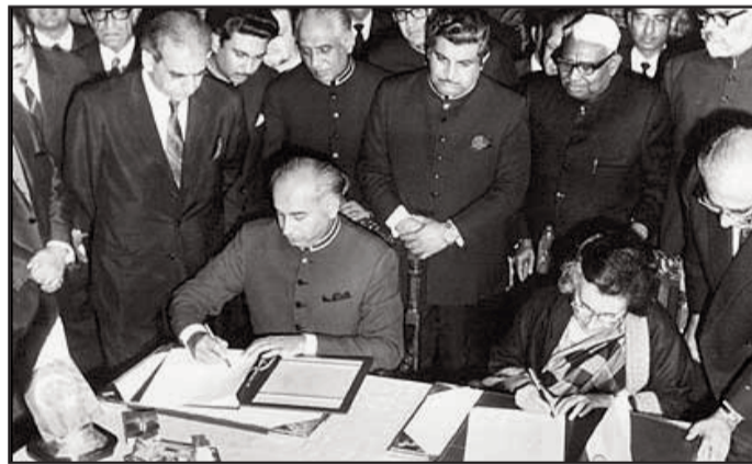
The Simla agreement was a case of Indian idealism trumping reality

ture that supported "an idealistic inflection of foreign policy," but yet one that constantly suffered from the tension between the work-in-progress growth of the Indian national ethos and the realpolitik demands of foreign policy based purely on concerns about national interest.